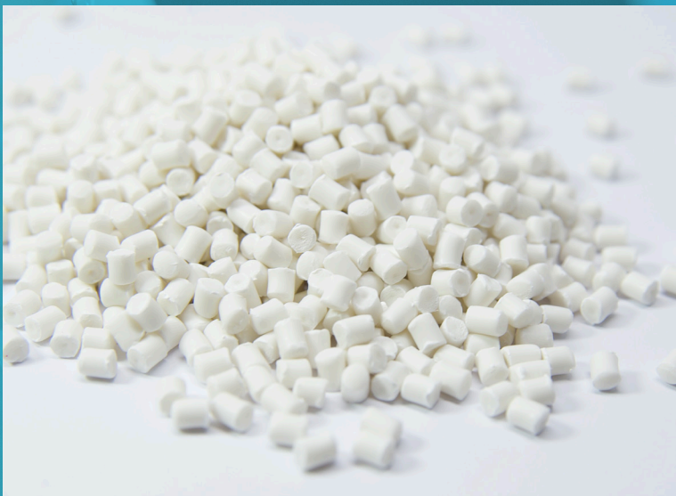
Hydrocerol Chemical Foaming Agents are supplied as concentrates